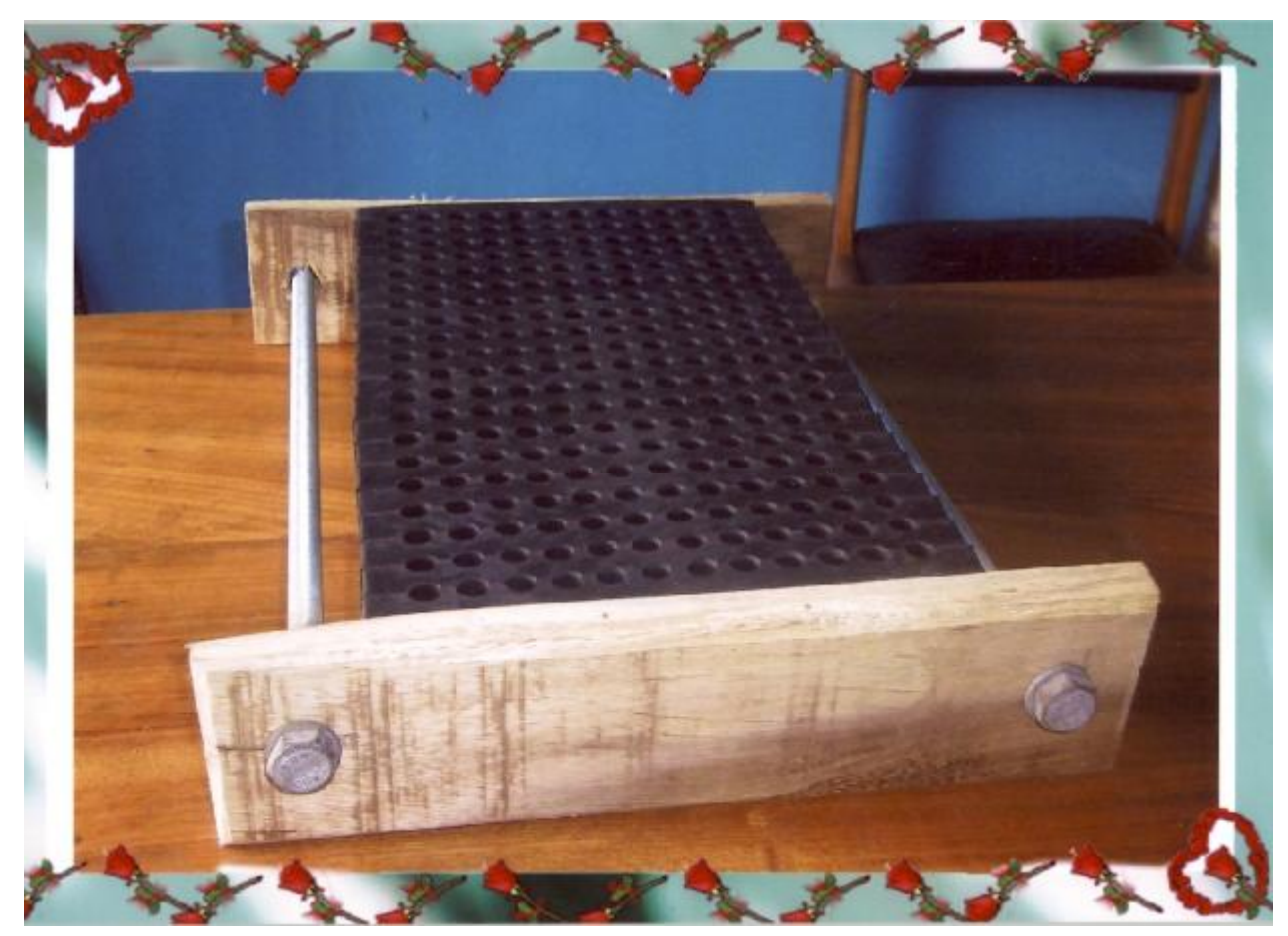
Rubber Chalk Mould

www.chalkmouldnigeria.com www.nigeriabusinessportal.com